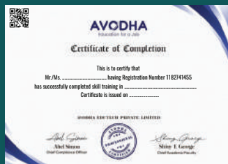
AVODHA Course Completion Certificate