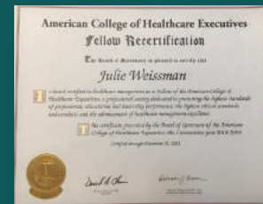
FACHE Certification (Paid)