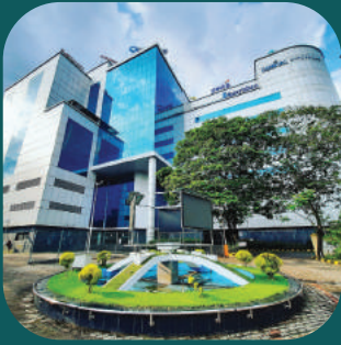
Kochi (Head Quarters)